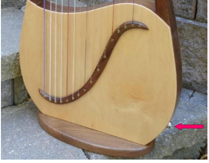
Can I have a mic pick-up added to the harp?

Yes, we can install a mic pick-up during construction for an additional fee. You can see where you plug in the cord at the bottom right of the harp in the picture above