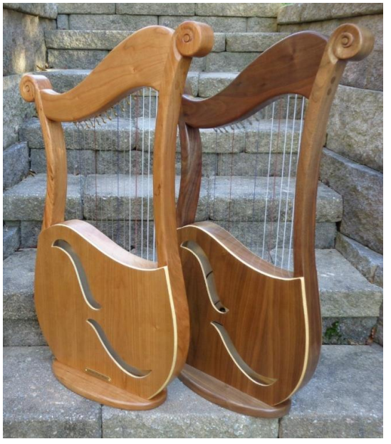
Back View: Cherry (left), Walnut (right) See order form for prices of both cherry & walnut.

Note: The standard price is for a semi-gloss finish--you can request a high-gloss finish (for an extra fee).