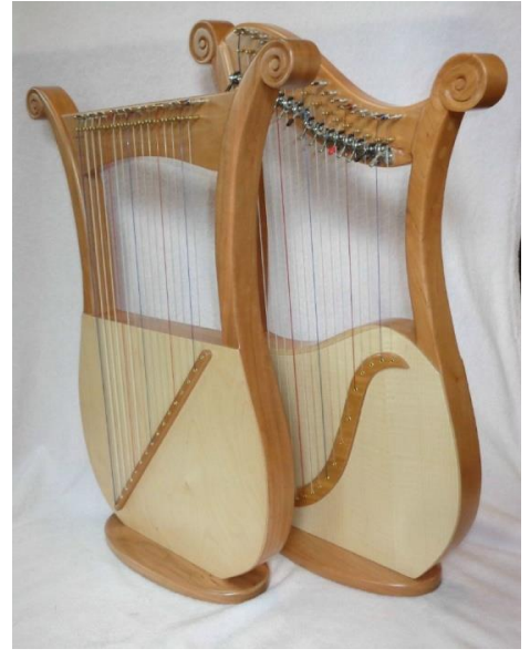
16-Davidic w/scrolls (left), 16-Lyre (right) in cherry. Note: our 16-Davidic now has a new bridge

Both harps have the same range (starting at a Low F, but the Lyre is more expensive because of the design. The walnut Davidic (pictured top left is the old version, and we now make a new style 16-Davidic with a new improved style bridge (which can also have scrolls).