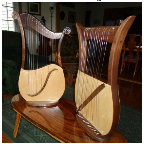
16-Lyre (left) & 16-Davidic (right), in walnut (there's an extra fee for walnut wood)

What is the difference between the 16-Lyre and the 16-Davidic Harp?