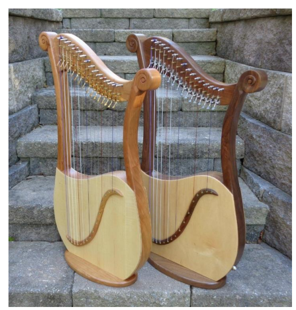
Front View: Cherry (left), Walnut (right) (Walnut wood is an extra fee)