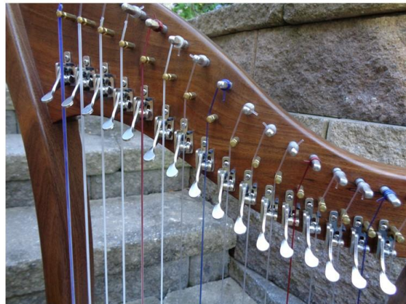
Silver Rees Levers

Note: You can get a full set of levers or partial (such as C+F's or C,F+B)