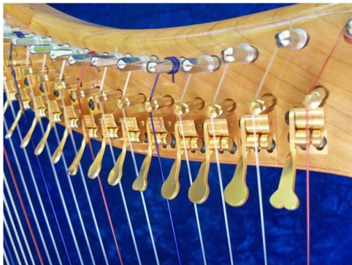
Gold Truitt Levers

The oval stand is used for display only. The backplate enables the player to stand or walk with the harp while playing and the support bar makes playing this harp on your lap easier (it has high-friction on the bottom and won't slide on your lap). Prices will vary depending on your wood choice. See order form for prices for each accessory.