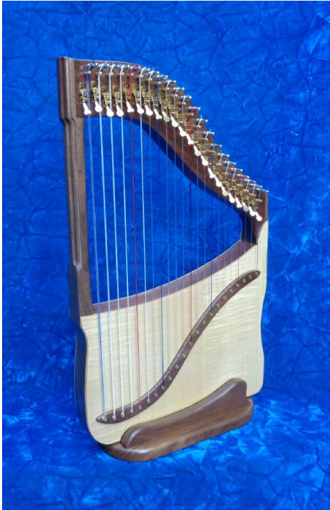
Front View: 22-Travel Harp (walnut, semi-gloss)

Note: There is an extra fee for walnut wood.