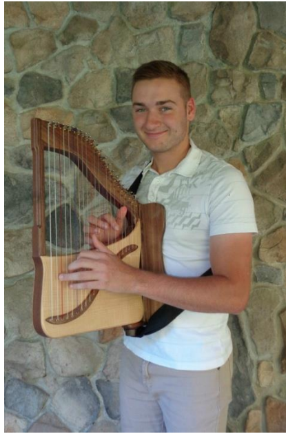
Backplate with strap