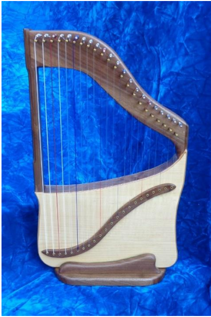
Oval Display Stand