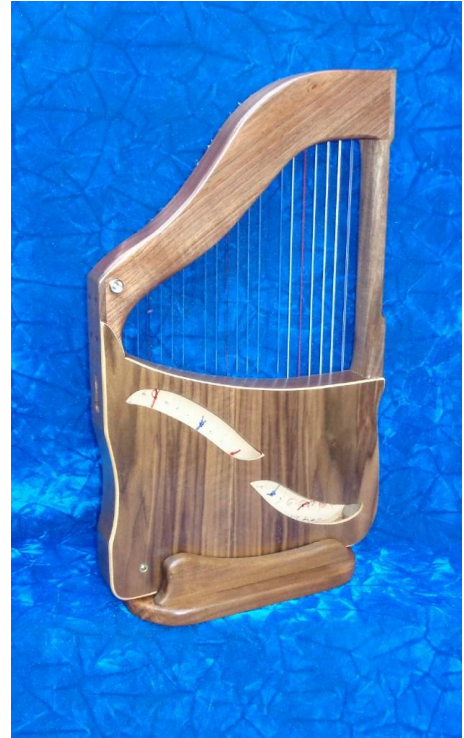
Back View: 22-Travel Harp (with display base)

Note: There is an extra fee for walnut wood.