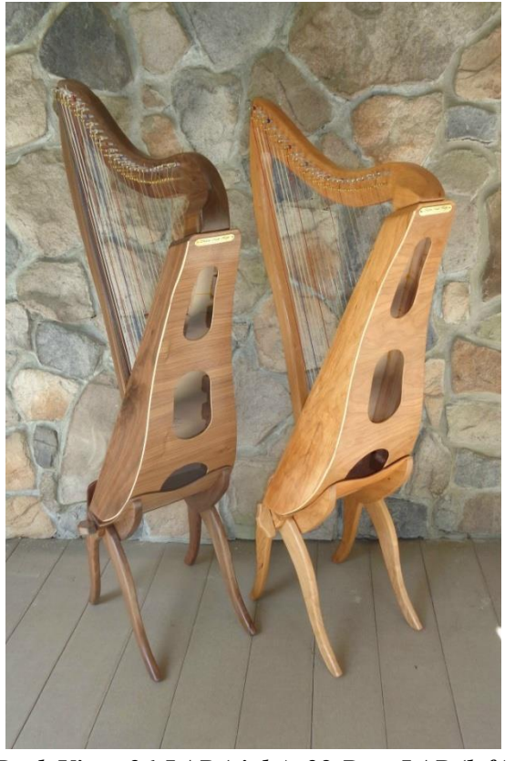
Back View: 26-LAP (right), 28-Bass LAP (left)

The 26-LAP Harp starts at a Low C (an octave below middle C), whereas the 28-Bass LAP Harp starts four notes lower at a Low F. The body (sound chamber) of both harps is the same size, but the pillar is 3" longer on the 28-Bass LAP (and the neck is an inch longer). See order form for current prices.