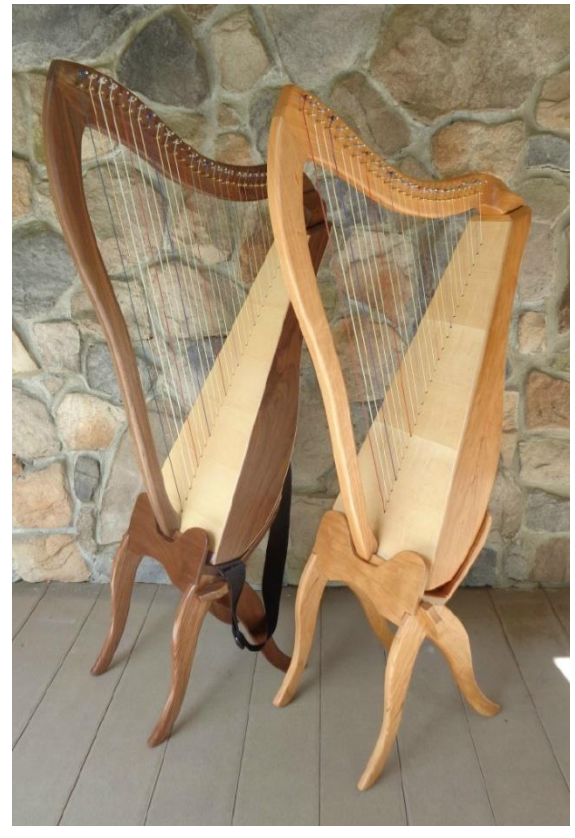
26-LAP (cherry, right), 28-Bass LAP (walnut, left)

What's the difference between a 26 and 28-string LAP Harp?