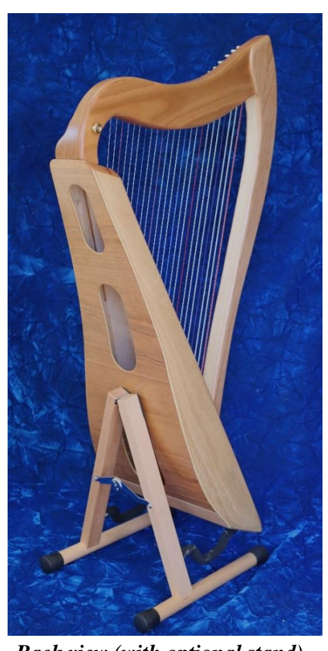
Back view (with optional stand)