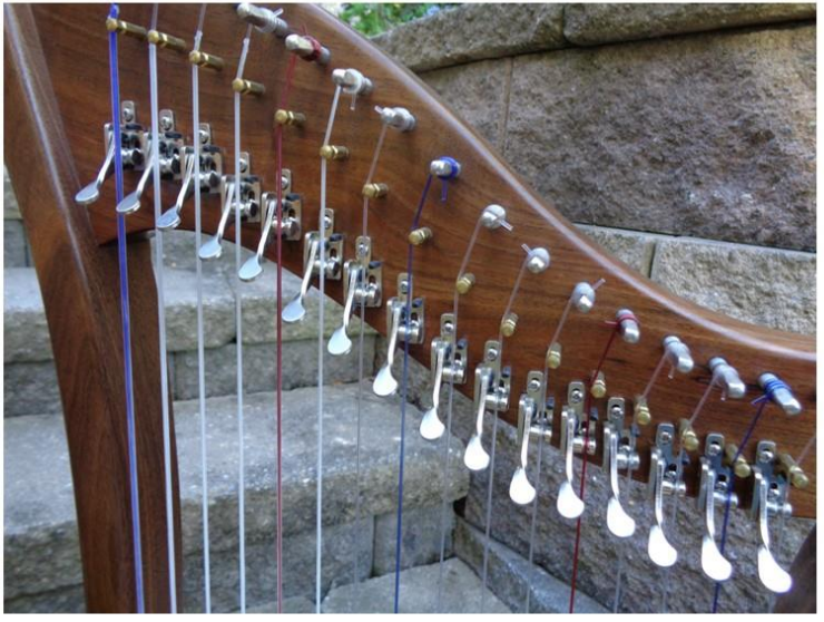
Silver Rees Levers

Note: You can get a full set of levers or partial (such as C+F's or C,F+B) For prices see order form.