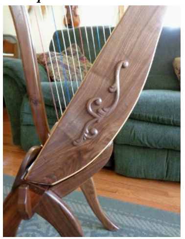
Side Swirl Carving

For more ideas on hand-carvings, go to our website and click onto "Hand Carvings" which is located under the Regency Harps. We can do specialty carvings to personalize your harp, but the price will increase depending on how much detail is in the carving. See order form for prices.