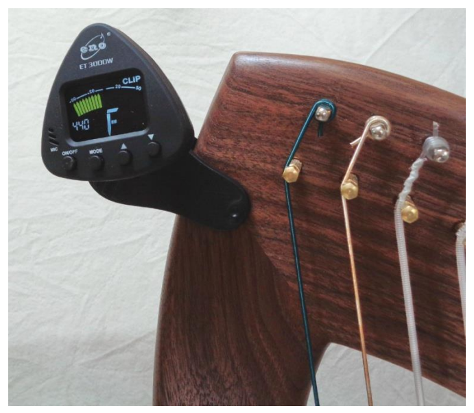
ENO ET-3000A Electronic Tuner

If you want to change the frequency from 440 to 432 or something different, then you'd want to get the ENO ET-3000A (shown above), so that you can change it with the arrow buttons.