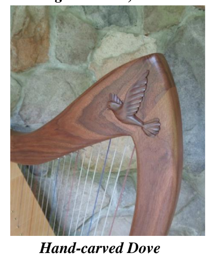
(we now place it on top of an overlay)