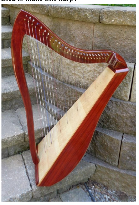
26-LAP made of Padauk wood. (This wood starts off bright red when new, and then it darkens into a dark reddish/brown color)

We usually use either walnut or cherry (because they are the lightest weight woods), but we can also make these harps in exotic woods such as African mahogany or Padauk (for an extra fee).