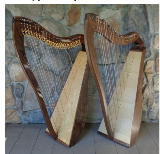
Shown above in high-gloss (left) vs. semi-gloss (right) There is an extra fee, so check the order form for prices.