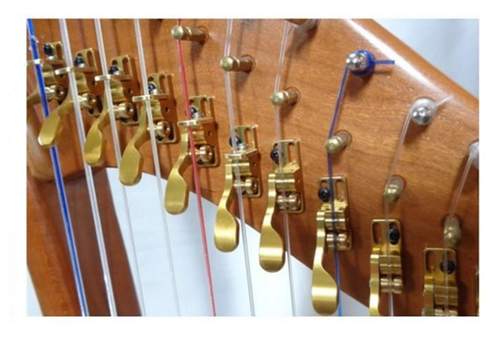
Shown Above: Gold Forte Levers Silver Forte Levers are also available