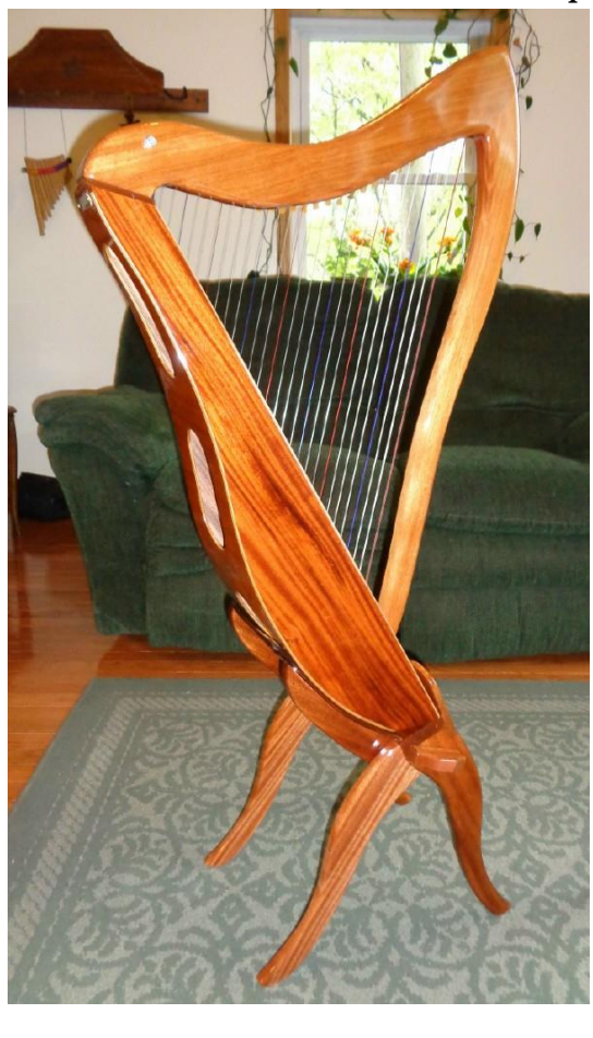
26-LAP made of African Mahogany