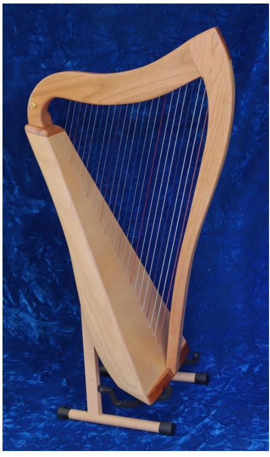
Front view (with optional stand)

Our new 24-string Therapy LAP Harp looks a lot like our regular 26-LAP Harp (and starts at low C, but it is a bit smaller and lighter in weight. We make it with a combination of cherry and paulownia wood so it only weighs 5 pounds and 3 ounces. This is perfect for those who go to hospitals to play for the sick because you can play it standing it with a strap and it is not heavy on you.