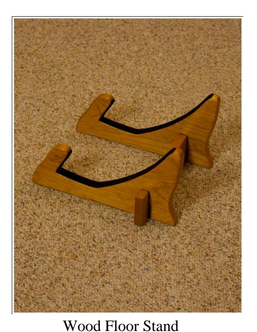
High-Gloss (is extra) The floor stand can be used with small children or as a display stand)