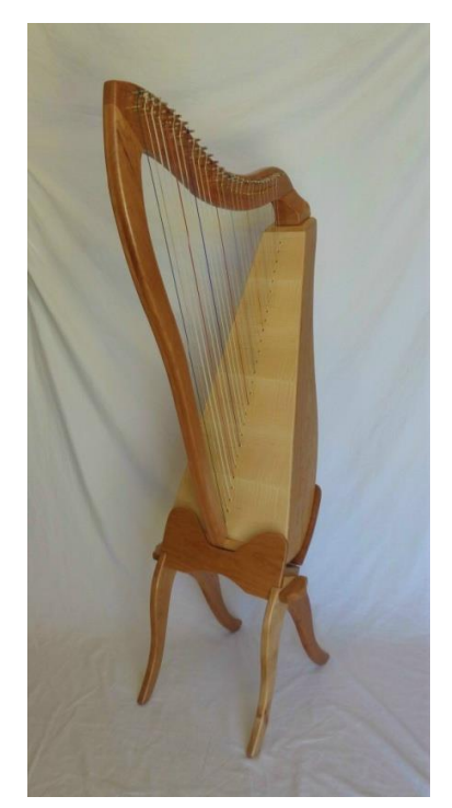
Wooden Collapsible Stand: (semi-gloss finish) (high-gloss finish is extra)