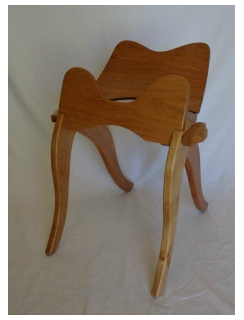
We now make a new style of a LAP stand with a straight back. High-gloss would be extra. Note: other woods like walnut or exotic ones like Padauk is extra.