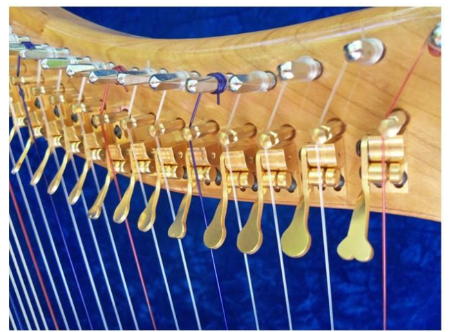
Gold Truitt Levers