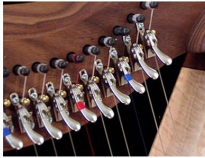
Top: Gold Truitt Levers Bottom: Gold Forte Levers