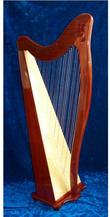
38-Regency Robusto (shown in exotic Padauk, high-gloss)

(Note: there is an extra fee for walnut and exotic woods)