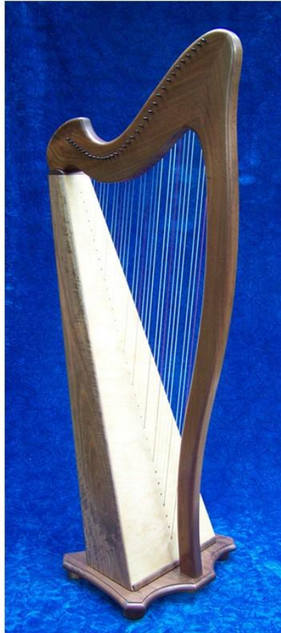
34-Affordable Regency (shown in walnut, semi-gloss)