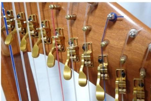
Top: Gold Truitt Levers Bottom: Gold Forte Levers