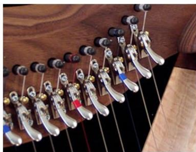
Top: Gold Camac Levers Bottom: Silver Camacs