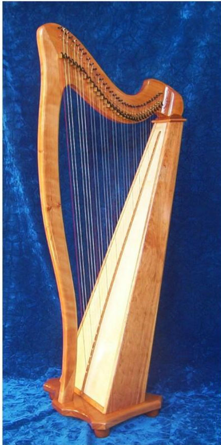
34-Regency Harp (shown in cherry, semi-gloss)