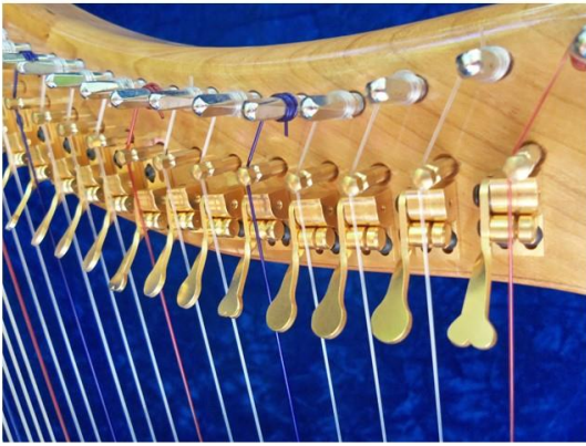
Gold Truitt Levers